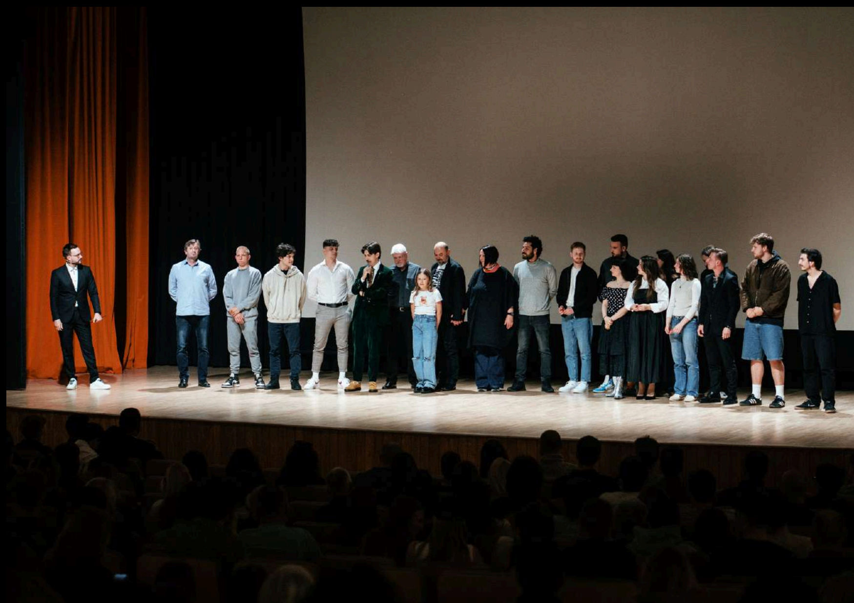
The filmmakers on stage at the Bled Festival Hall.