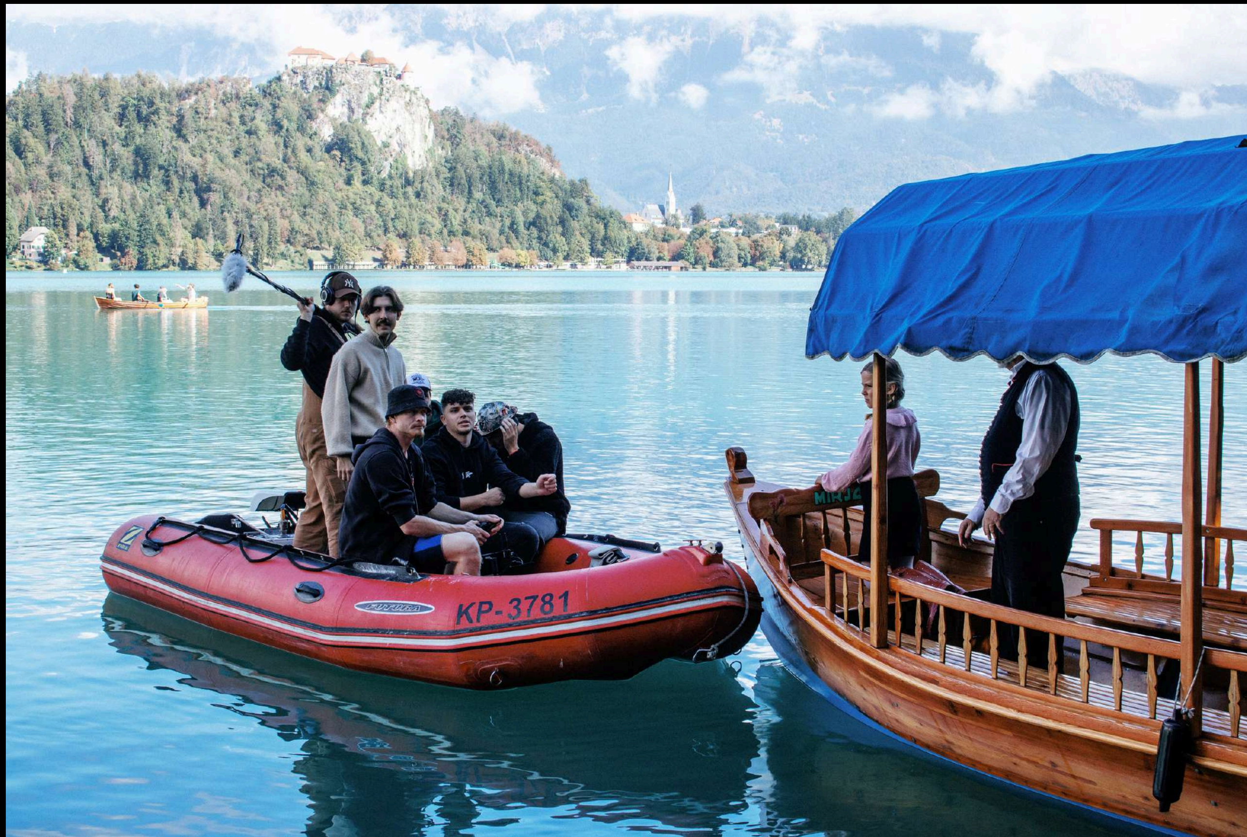
Filming a scene on the pier below Vila Bled.