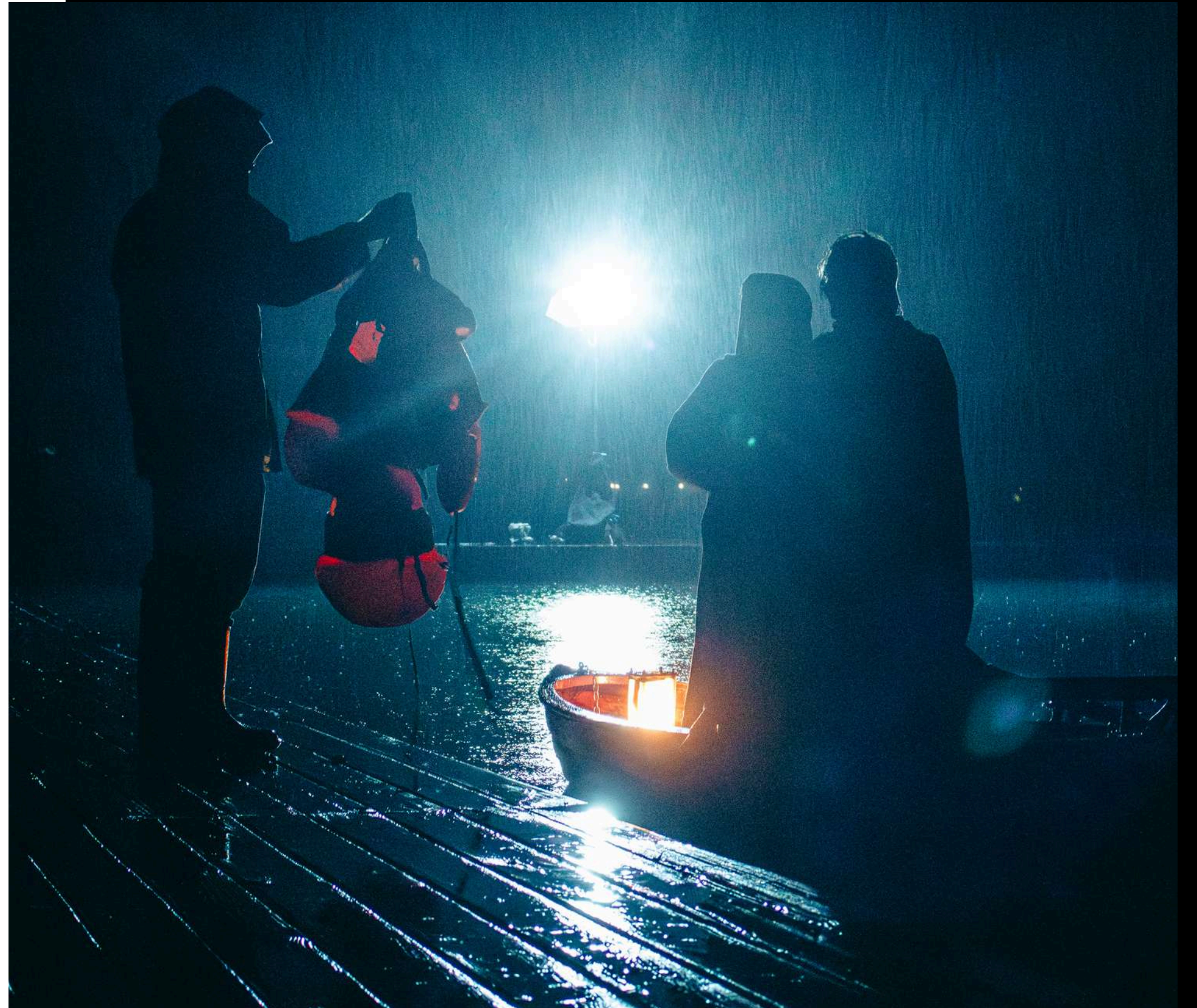
Filming of bandits in a boat at the Grajsko Kopališče.

Young creators (all in the team under 30 years old)