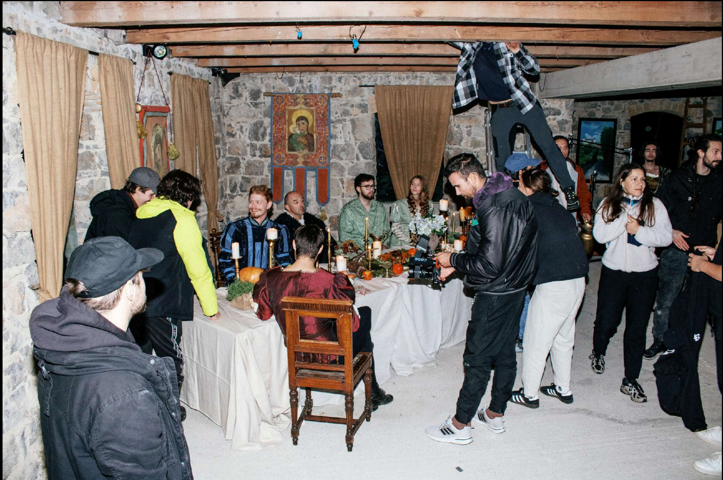
Filming a medieval castle dinner at Kostel Castle.