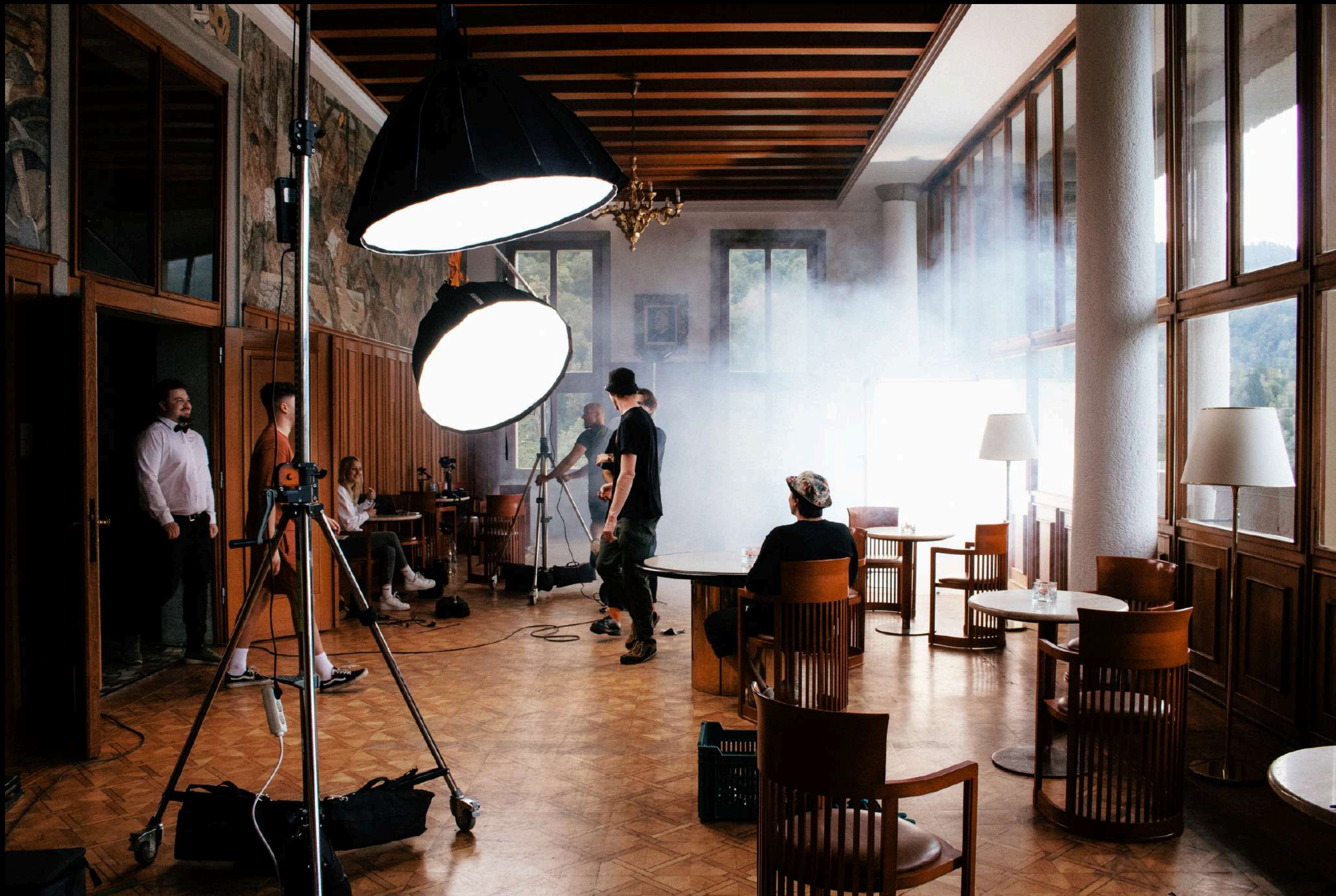
Filming a scene at the Belvedere Cafe in Bled.