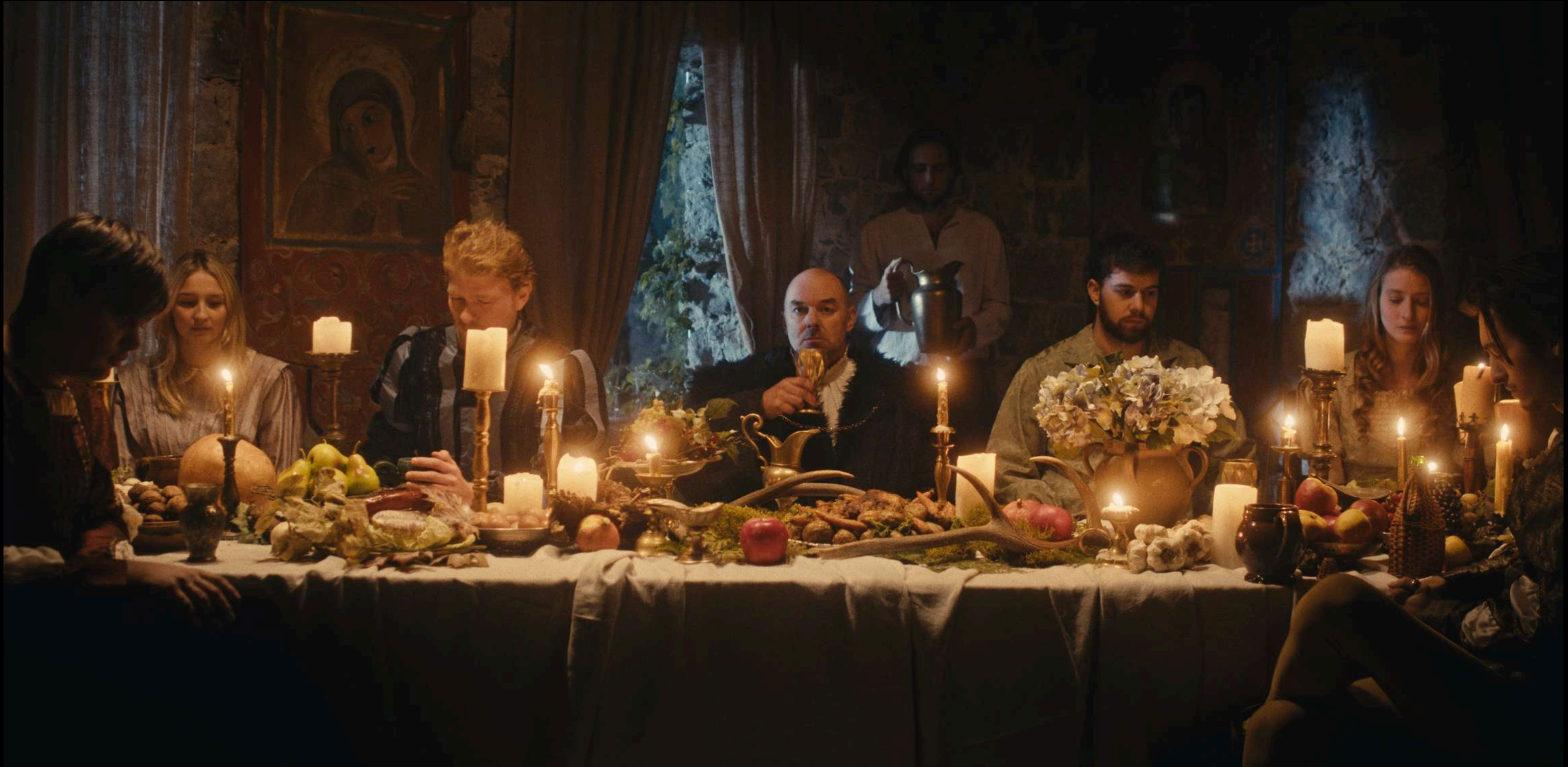
King Hartman and the nobles in the castle dining room.