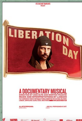
Liberation day (2016), directed by: Morten Traavik, Ugis Olte, musical, premiere: IDF Amsterdam, coproduction (NO, LV, SLO)