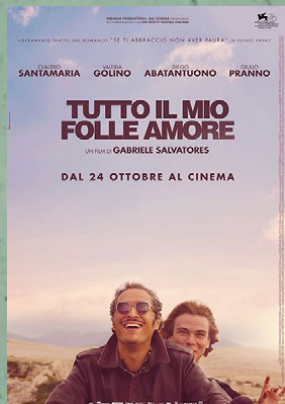
Tutto Al Mio Folle Amore (2018), directed by Gabriel Salvatores (an Oscar winner), service production (IT, SLO)